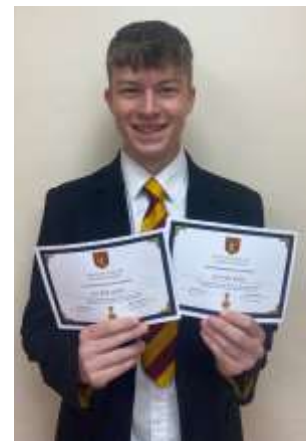
Oliver Reed 9AD