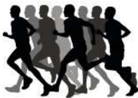
Oliver Reed 9AD