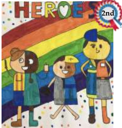
Mio Evans 7EM