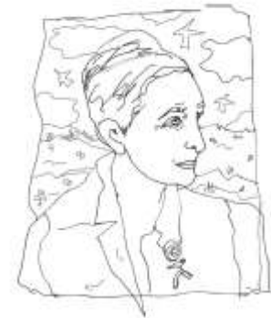
Georgia O'Keeffe Museum

An example of the activities available on the website.