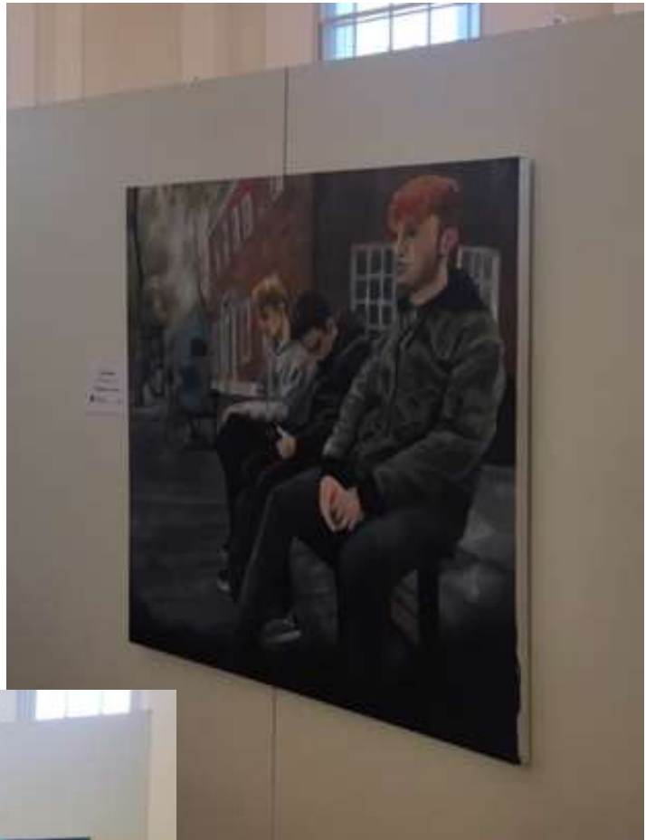
Boys on a Bench by Christopher Benn Oil on canvas— one meter by one meter

https://www.stalbansmuseums.org.uk/whats-on/schools-art-exhibition