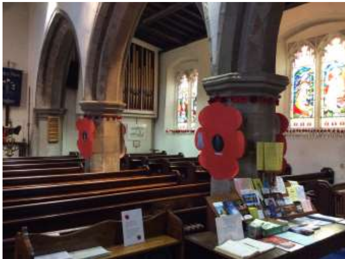
Year 8 work in St Stephen's church on Watling Street for their Great War history exhibition.